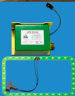
6 Power Supplies 36 or 42 Lights